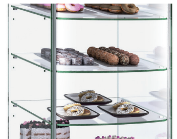
Panoramic display area and curved shelves