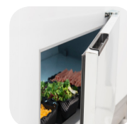
Rear storage door