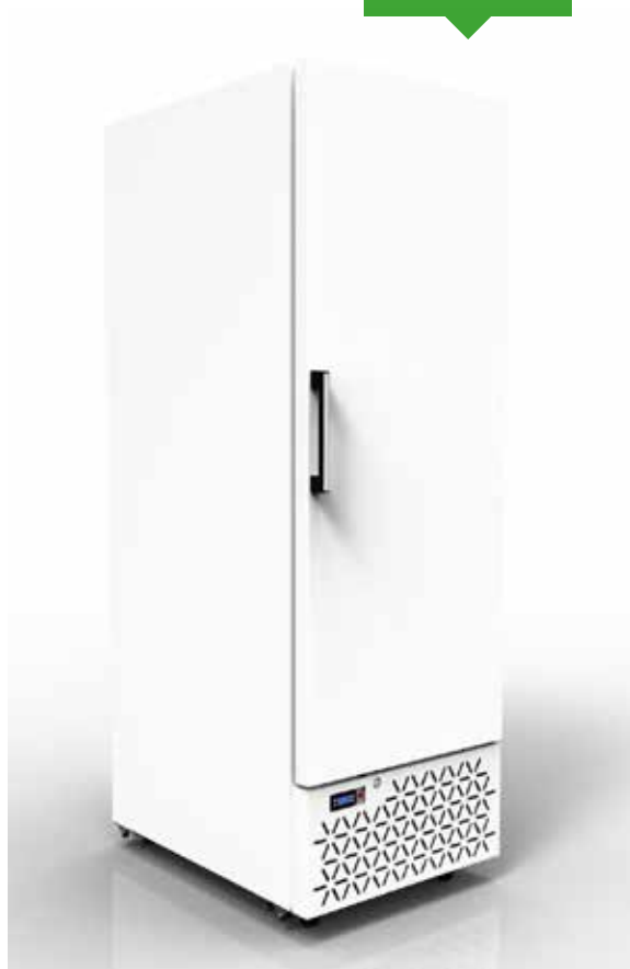
Napoli Pans Fully Stacked (extra shelves required, POA)